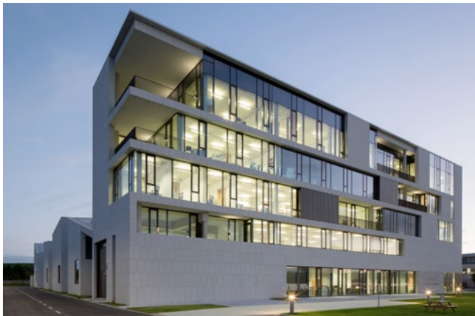
Below: The two buildings of The Environmental Research Institute, home to the MaREI centre.

MaREI is co-ordinated by UCC’s Environmental Research Institute. The ERI is a flagship research Institute at University College Cork, Ireland (UCC) that carries out inter-, multi- and trans-disciplinary research focusing on climate action, circular economy and healthy environment. The mission of the ERI is to generate new research knowledge for the understanding and protection of our natural environment and develop technologies, tools and services to facilitate a transformation to a low carbon and resource efficient society. The Institute brings together over 300 environmental researchers from across science, engineering, business and humanities to address complex environmental challenges in a multi-disciplinary approach. The ERI also incorporates a number of environmental research centres including MaREI, Aquaculture and Fisheries Development Centre (AFDC) and the Centre for Research on Atmospheric Chemistry (CRAC).